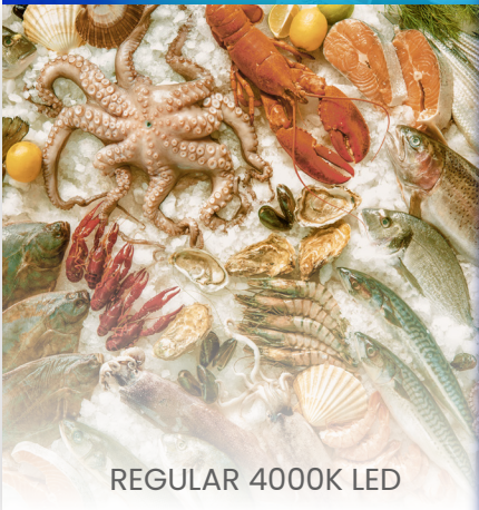
REGULAR 4000K LED

Promolux LED lighting is the ideal solution for supermarkets and seafood markets aiming to improve seafood display longevity and minimize waste. Using Safe Spectrum Technology®, Promolux LEDs reduce photo oxidation, preserving the freshness and vibrant colors of fish, shellfish, and other seafood.