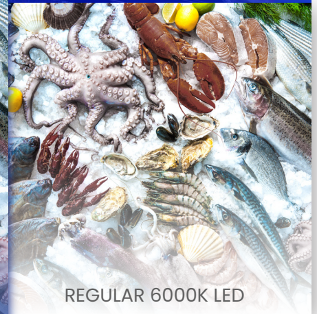
REGULAR 6000K LED